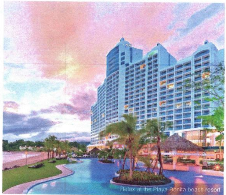
Relax at the Playa Bonita beach resort

DAY 4 Panama City – Playa Bonita: Depart the city and journey by coach to La Playa Bonita beach area. Enjoy the next three nights in the relaxed atmosphere of the resort. Meals: B, L, D