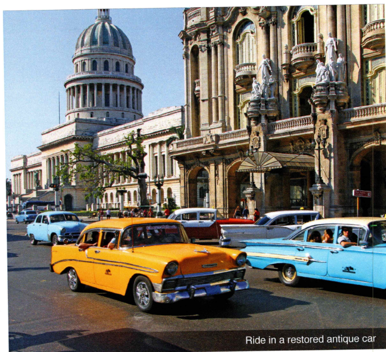
Ride in a restored antique car

Americans can once again travel to Cuba legally and Mayflower Cruises and Tours has planned an amazing trip for you to this country which has previously been 'off-limits'. Our program complies with the OFAC (Office of Foreign Assets Control) regulations for travel-related activities to Cuba and was specifically designed to qualify under the General License "515.574 "Support for the Cuban People". Keeping with the license regulations, the designed itinerary provides a full-time schedule and does not include an excess of free time or recreation. Our journey through Cuba supports individuals and non-governmental organizations that promote travel and independent activities intended to strengthen civil society in Cuba, enhance contact with the Cuban people, support civil society in Cuba, or promote the Cuban people's independence. Our itinerary meets these requirements with the variety of activities we included for you to experience on this educational and interactive program. From the welcoming smile and wealth of knowledge provided by our professional coach drivers and tour guides to the planned visits to historic and cultural areas, meals taking place in local paladars, meetings with tradesmen, artisans, dancers, and other people you'll encounter throughout your stay, your program results in meaningful interaction with individuals in Cuba, thereby promoting the goals of the license and giving you an insightful understanding of the Cuban culture.