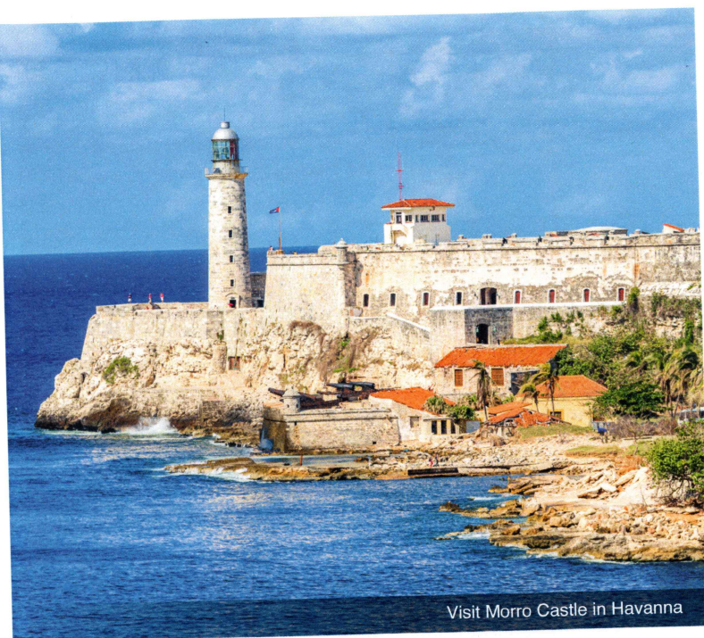
Visit Morro Castle in Havana

such an important role in changing the lives of the children. After lunch at a paladar, attend an interactive and cultural exchange with dancers when visiting a dance studio. Talk with the teacher and students, see how the Cuban Salsa is done, and learn how to do this dance yourself! This evening, dinner is held at a local paladar for your immersion into local culture, dining on local cuisine and mingling with the staff. Meals: B, L, D