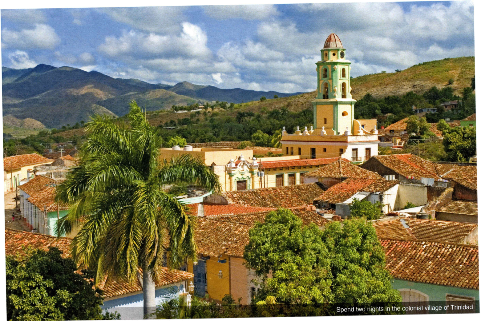
Spend two nights in the colonial village of Trinidad