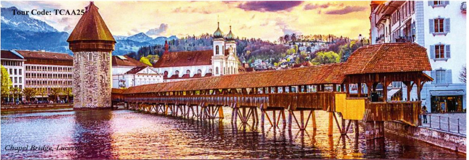
Chapel Bridge, Lucerne